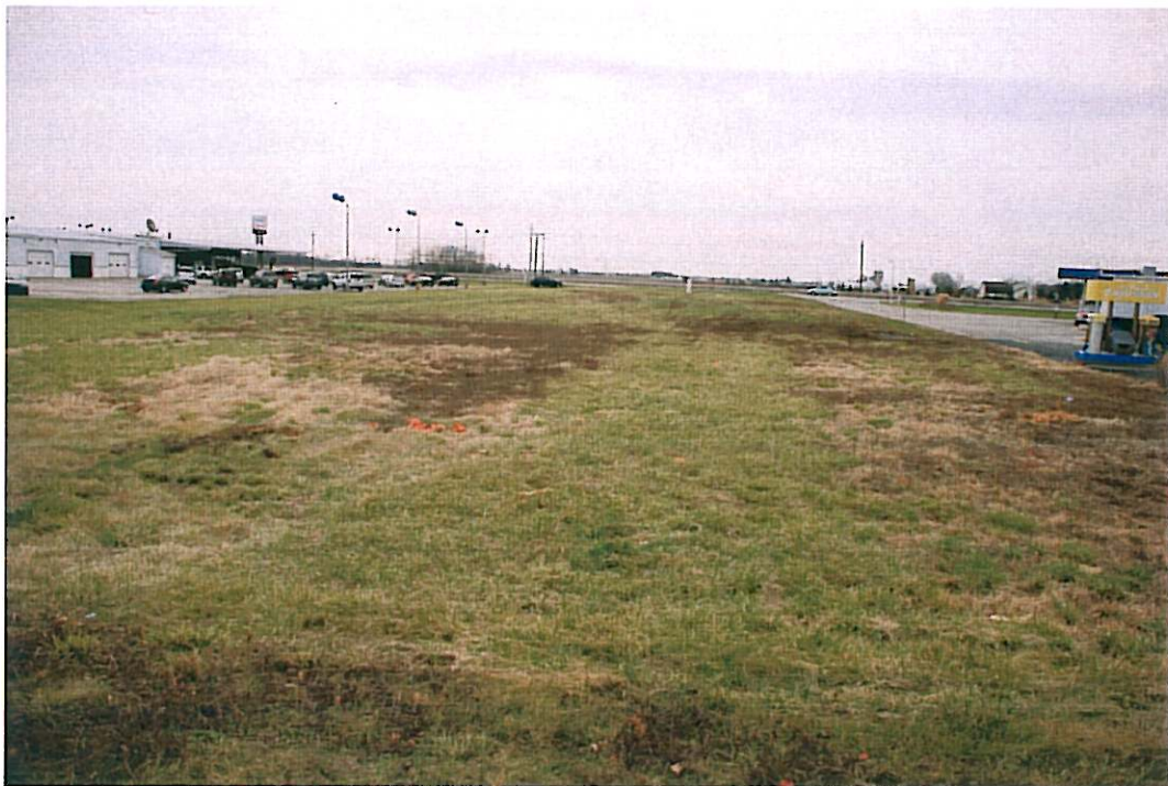
Photo looking South towards St. Rt. 64